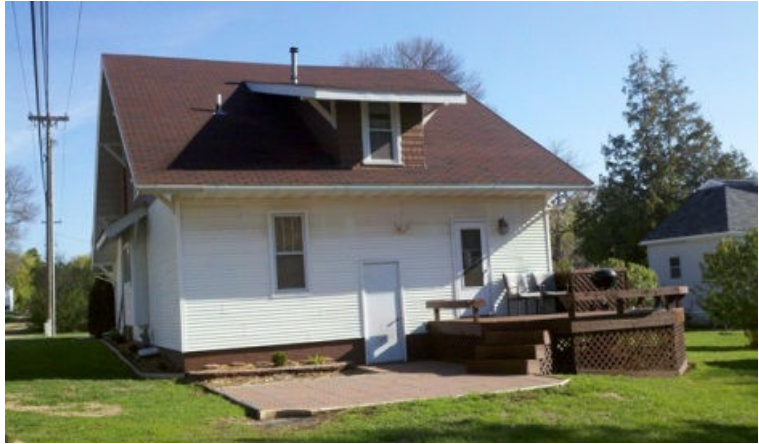
Lower Level (Potential apartment or business with separate entrance)